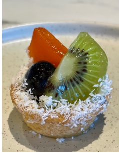
Fruit Tartlet $4 minimum 10