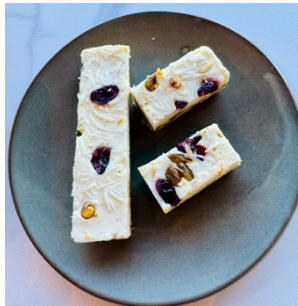
Pistachio Cheesecake $6.5 / $3.8 minimum 4