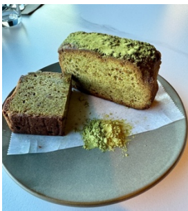
Matcha Butter Cake $7 / $4 minimum 4