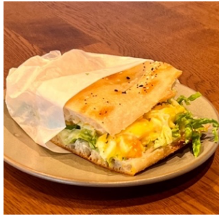
Creamy Egg Pide Creamy Egg Mayo, lettuce (Vegetarian) $14 / $4 minimum 4