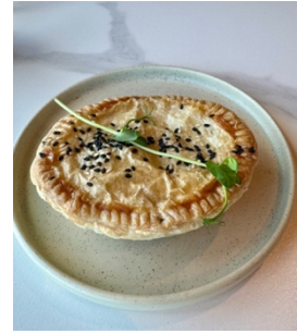
Chicken Pie Chicken, Mushroom, Bacon, Cream $13