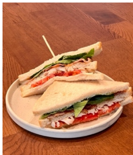
Club Sandwich Toasted white bread, chicken, bacon, mayo, lettuce & tomato $14 / $4 minimum 4