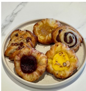
Assorted Mini Danish $3.8 each minimum 5