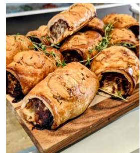
Sausage Roll Pork or Vegetarian $9