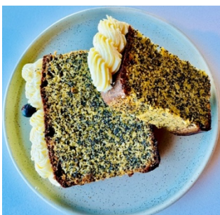
Poppy Seed Cake $6.5 / $3.8 minimum 4