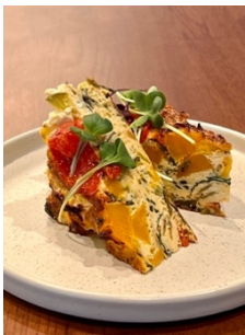
Mini Frittata Bacon or Vegetarian $4.00 minimum 6