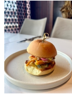
Vegetable Slider Roasted vegetables, hummus, brioche bun (Vegetarian) $9 minimum 4