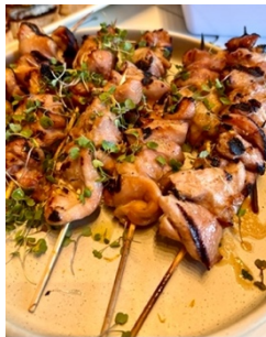
Chicken Skewers $5.5 minimum 6