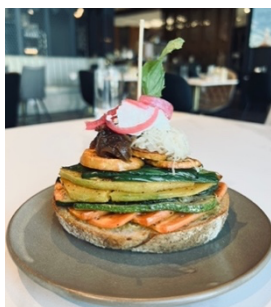
Roasted Vegetable Sandwich Seasonal Vegetables, Hummus, Rye (Vegan) $15