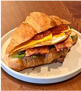
Breakfast Croissant Bacon, Egg, Cheese, Tomato Chutney, spinach $15