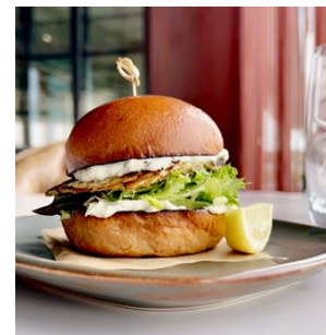
Fish Slider Pan seared market fish, lettuce, tartar sauce, Brioche Bun $9 minimum 4