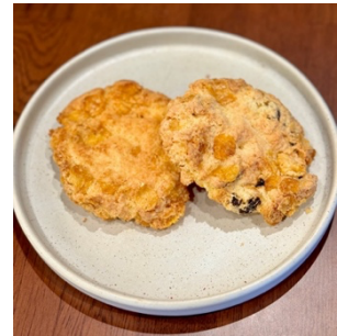
Coconut Cornflake Cookie GF $5.5