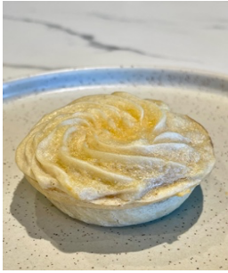
Mini Potato Top Pie $3.50 minimum 6