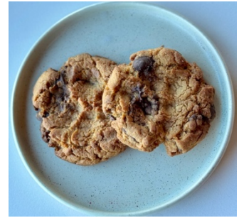
Chocolate Chip Cookie $5.5