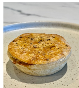
Mini Mince Pie $3.50 minimum 6