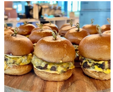
Beef Slider Wagyu beef, cheese slices, mustard, ketchup, brioche bun $9 minimum 4