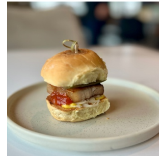
Pork Slider Pork belly, mustard, ketchup, brioche bun $9 minimum 4