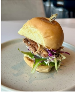
Chicken Slider Fried Chicken, Slaw, 55's Secret Sauce $9 minimum 4