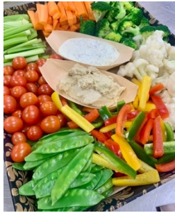
Crudité Platter Raw Seasonal Vegetables, Ranch Dressing, Hummus $30 for 4