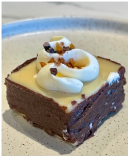
Salted Caramel $4 minimum 10