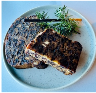
Earl Grey Tea Cake $6.5 / $3.8 minimum 4