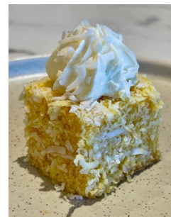
Lamington $4 minimum 10