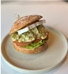
Chicken Pesto Roll Chicken, Pesto, Brie, Lettuce, Tomato $14 / $4 minimum 4