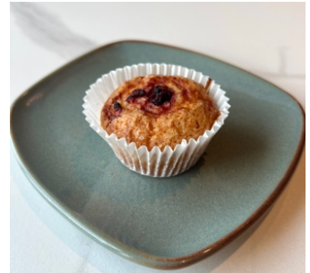
Mini Berry Muffin $3.80 minimum 4