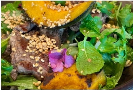
32oz Salad Bowl $14