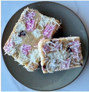
Lolly Cake $6 / $3.5 minimum 4