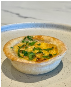
Mini Quiche $3.50 minimum 6