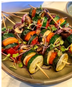
Vegetable Skewers Vegan $5 minimum 6