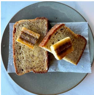
Banana Cake $6 / $3.5 minimum 4