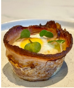
Keto Muffin (Gluten Free) $5 minimum 4