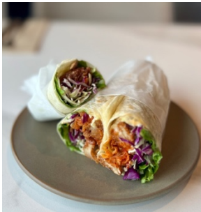
Fried Chicken Wrap Fried Chicken, Slaw, Kimchi, Mayo $15 / $4.5 minimum 4