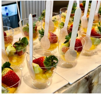
Fruit Cup $5 minimum 5