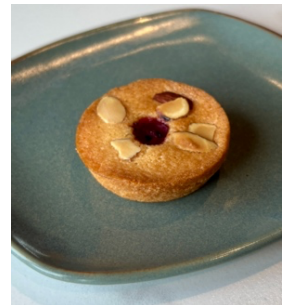
Raspberry Almond Friand GF $6 / $3.5 minimum 4