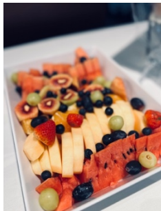
Seasonal Fresh Fruit Platter $40 for 4

Add Grilled Chicken Breast- $9 Add Lemon Garlic Prawns - $10 Add Marinated Beef - $10 Add Halloumi Cheese - $5