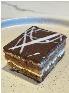
Opera Slice $4 minimum 10