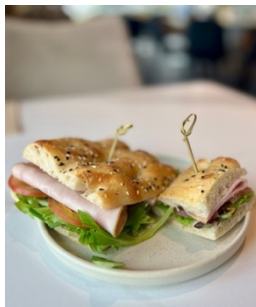
Cold Cuts Pide Pastrami or Champagne Ham, lettuce & tomato $14 / $4 minimum 4