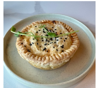
Steak Pie Slow cooked Beef, Carrot, Gravy $13