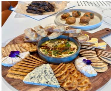
Cheese Board $60 for 4