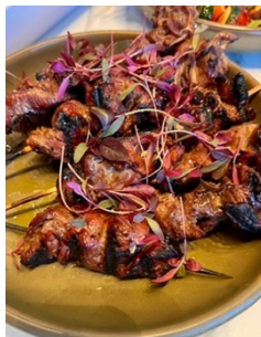
Beef Skewers $5.5 minimum 6