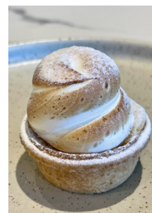
Lemon Meringue $4 minimum 10