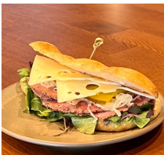
Reuben Sandwich Corned Beef, Swiss, Sauerkraut $15 / $4.5 minimum 4