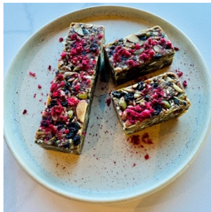
Muesli Slice $6 / $3.5 minimum 4