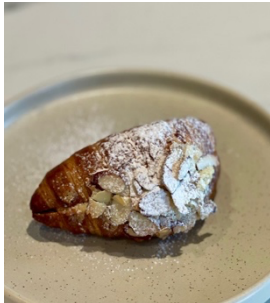
Mini Almond Croissant $3.80 minimum 4