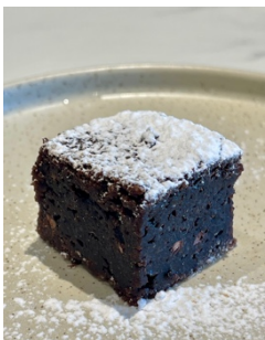
Chocolate Brownie $4 minimum 6