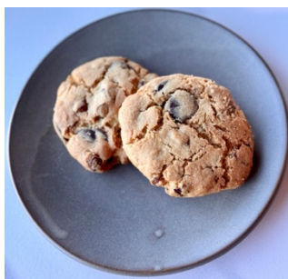
Soft Chocolate Chip Cookie $5.5