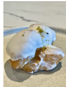
Pistachio Profiterole $4 minimum 10