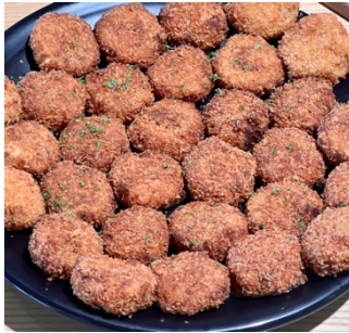
Potato Croquette (Vegan) $5 minimum 4