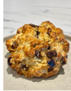
Mini Date Scone $3.80 minimum 4