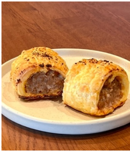
Mini Sausage Roll Pork or Vegetarian $3.80 minimum 6