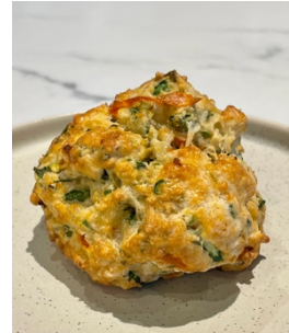
Mini Cheese Scone $3.80 minimum 4